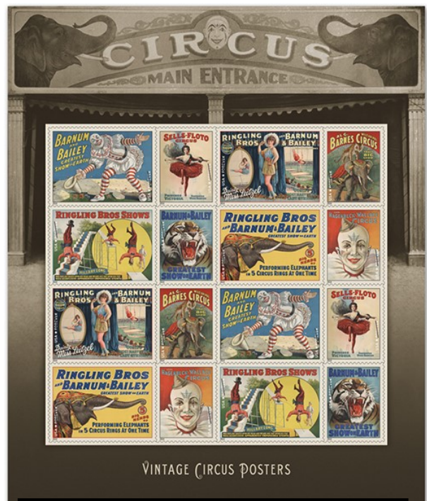
US #4905a Circus Posters