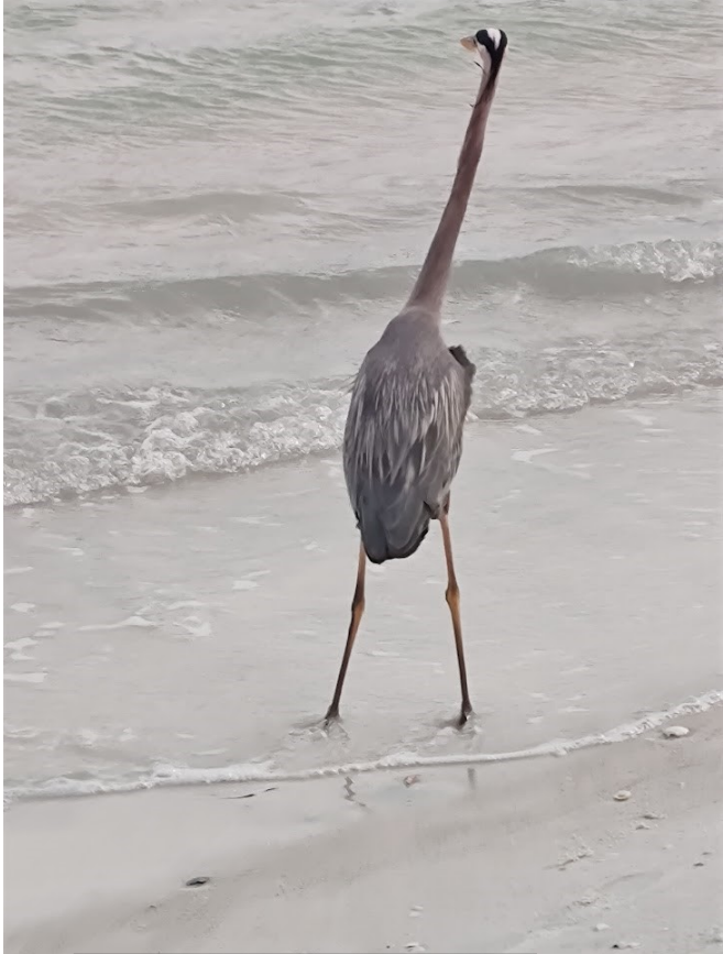
Going Clockwise Pelican diving for his next meal. Crane waiting for a fisherman on the beach to feed him.