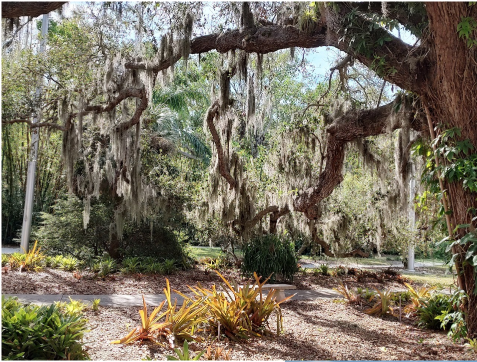
On the grounds of the Ringling Museums Below is another part of the Ringling complex, Art museum and courtyard